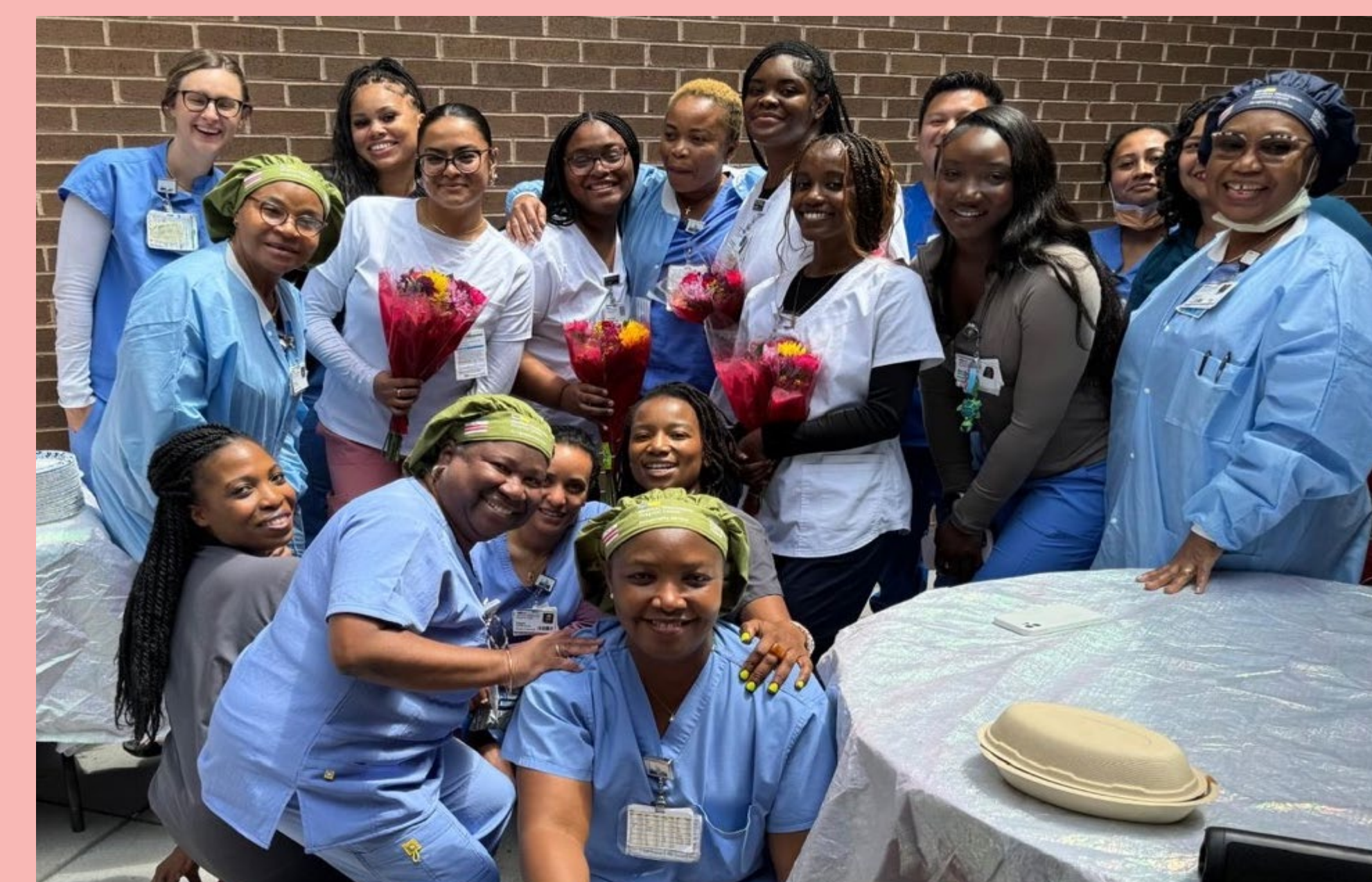
Image 1 PACU Team Members