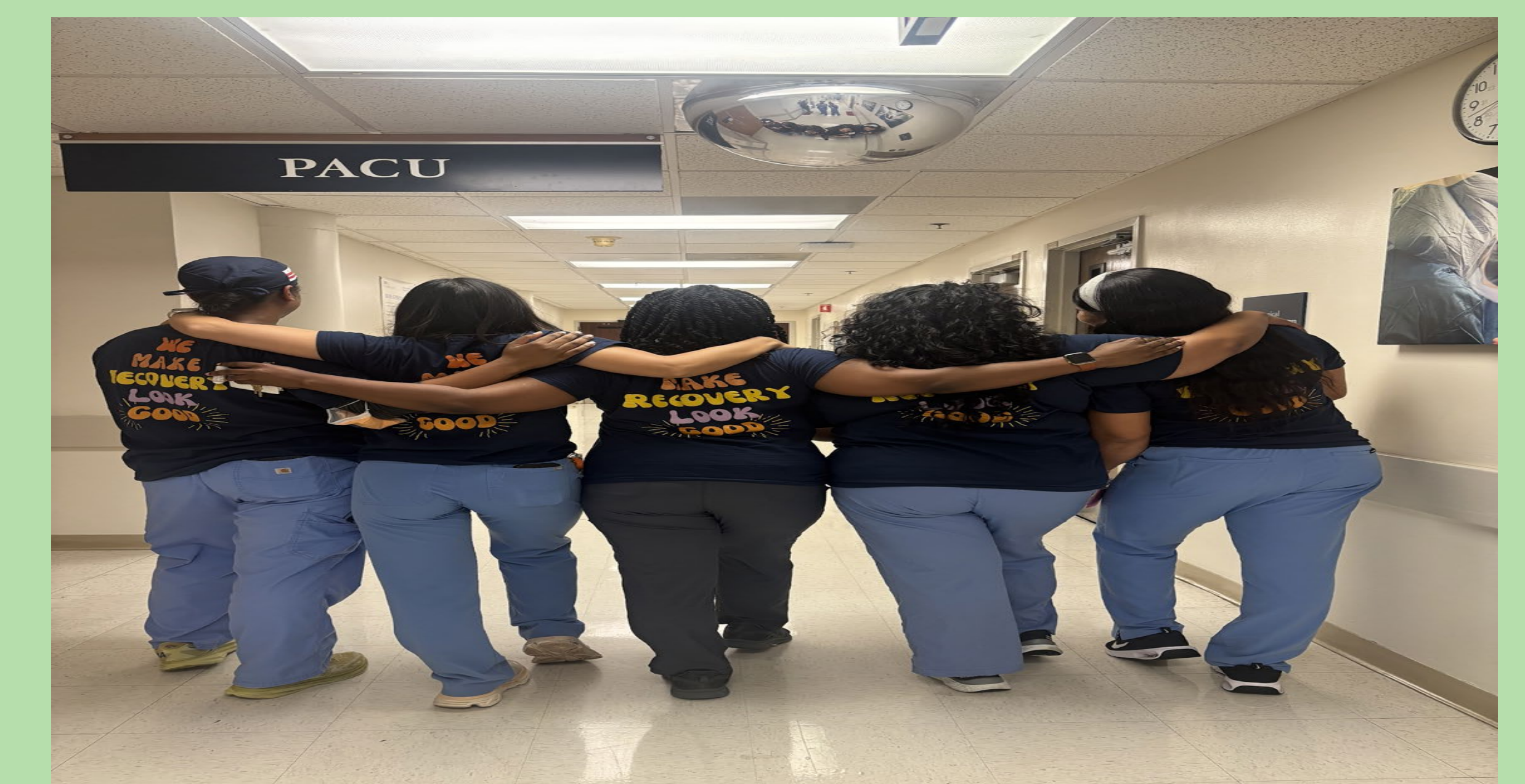
Image 2 PACU Team Members